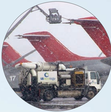
Propylene glycol recovered from airplane deicing operations, 2018

The thermal desorption process at our Robstown, TX facility recovers spent metal-bearing catalyst that has been discarded from the petroleum refining industry. The facility separates oil from the catalyst and repackages it for shipment. Additionally, valuable metals that accumulate in wastewater from metal-plating operations are recovered from filter cake generated by the wastewater treatment process. US Ecology identifies and further concentrates the filter cake to allow for the recovery of valuable base metals. The recovered catalyst and the concentrated metals in the filter cake are sent to third-party processors for final recovery.