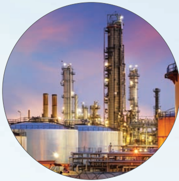
Oil recovered from hazardous sludges, 2018