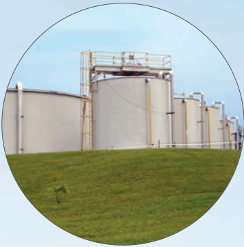
Hazardous wastewaters treated, 2018