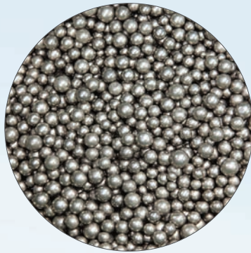
Metal-bearing catalyst recovered, 2018

Working with a technology partner, US Ecology operates a thermal desorption recovery process at our Robstown, Texas facility. The facility receives hazardous oil-bearing sludges and waste streams generated by the petroleum refining industry. The oil is recovered and sold back into the petroleum market.