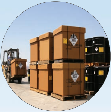
Waste entrusted to US Ecology for safe landfill disposal, 2018

US Ecology contributes to a sustainable environment by providing secure, environmentally protective solutions for the treatment, disposal, and recycling of waste generated by industrial processes, households or the cleanup of contaminated sites.