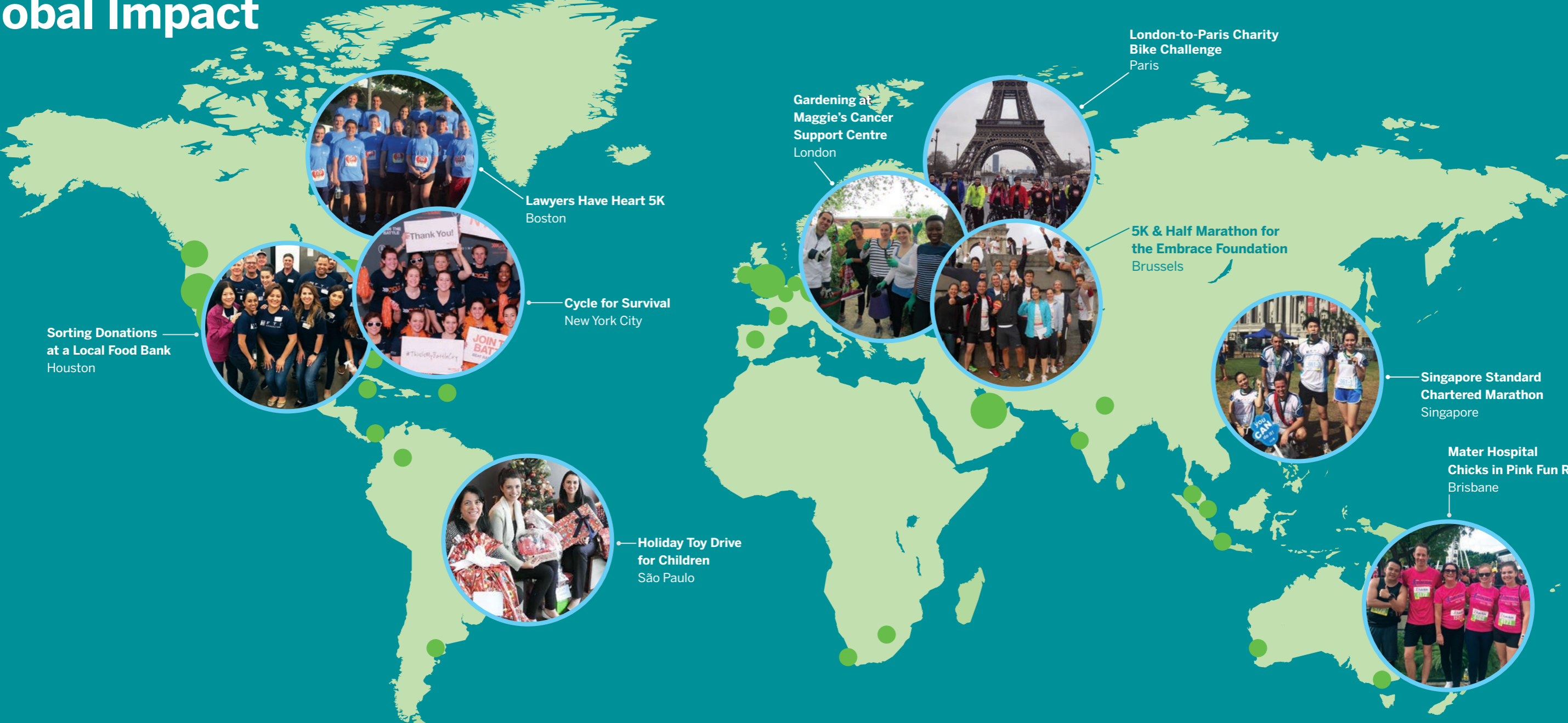
Sorting Donations at a Local Food Bank Houston