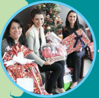
Holiday Toy Drive for Children São Paulo