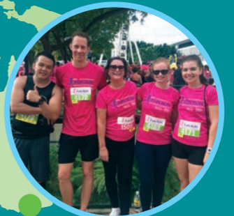
Mater Hospital Chicks in Pink Fun Run Brisbane