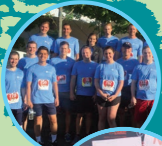
Lawyers Have Heart 5K Boston