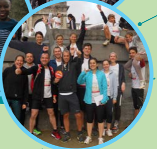
5K & Half Marathon for the Embrace Foundation Brussels