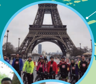
London-to-Paris Charity Bike Challenge Paris