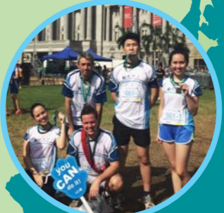
Singapore Standard Chartered Marathon Singapore