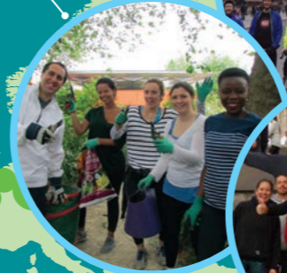
Gardening at Maggie's Cancer Support Centre London