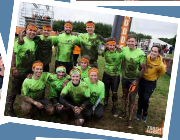
Dublin – Competing in a tough mudder for Barnardo's