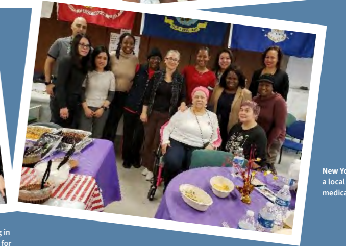
New York City – Visiting a local veterans affairs medical center