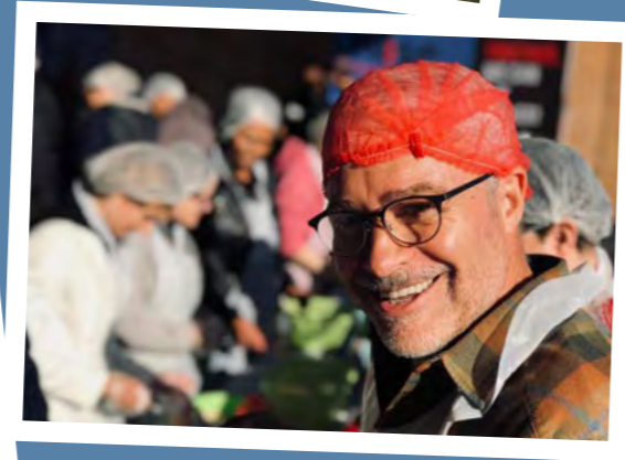
South Africa – Volunteering with Rise Against Hunger