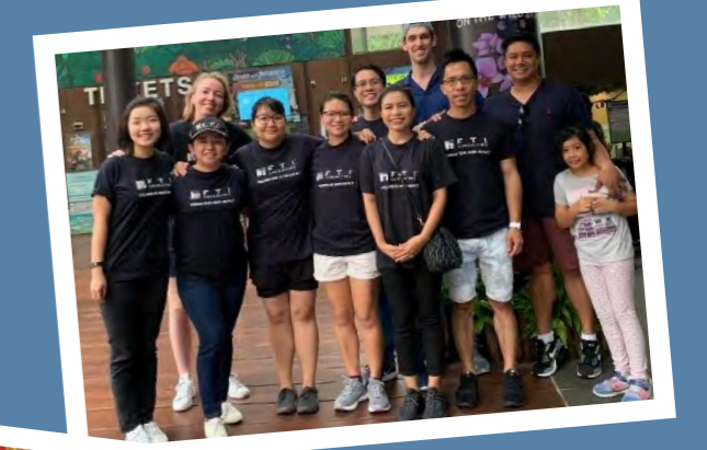
Singapore – Visiting the Singapore Zoo with Club Rainbow