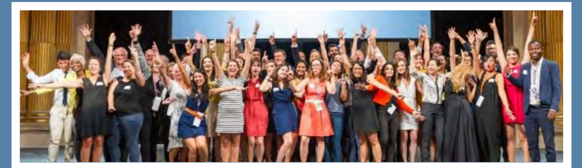
Paris – Volunteering with charity partner Article1