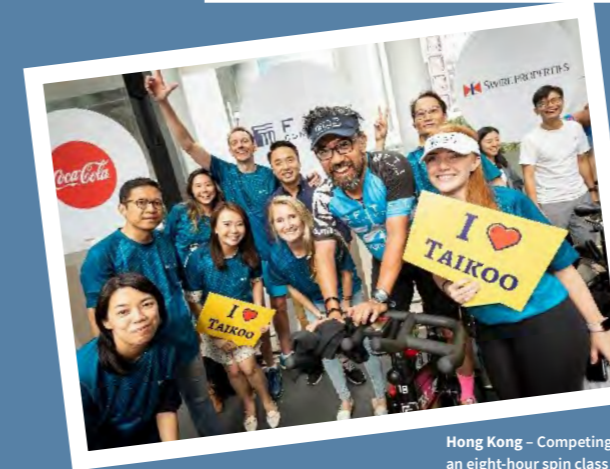
Hong Kong – Competing in an eight-hour spin class for Mind HK