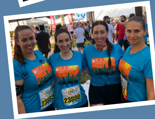
Miami – Running the Mercedes-Benz Corporate Run