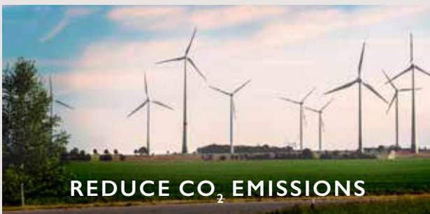
REDUCE CO 2 EMISSIONS